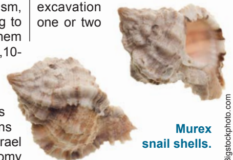
Murex snail shells.

This time around, structures from the First and Second Temple periods were discovered, including a ritual pool left almost completely intact, a vault, and a room with two ovens. Buildings from the Byzantine and early Islamic periods were also uncovered, as well as numerous coins, intact lamps, ceramic and glass vessels, bits of jewellery and similar items. However, one discovery takes us back even further. Uncovered were at least half a dozen Murex snail shells with holes drilled through them. “Prior to our excavation one or two