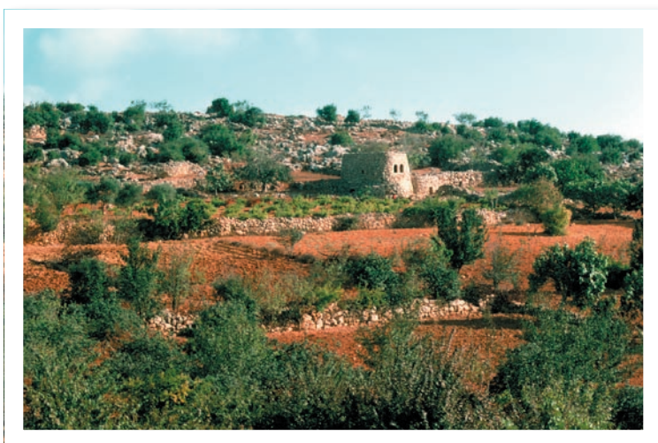
Scene in the hill country of Judah with a watchtower in the centre.