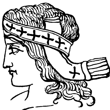
Fig. 2. Bacchus depicted with a headband covered in crosses

nian Messiah, is represented with a headband covered with crosses (Fig. 2 above).