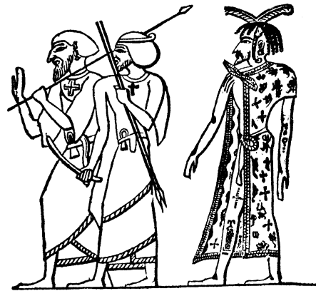
Fig. 1. Pagan priests with garments ornamented with the cross

In Israel the people were encouraged to put the Scriptures on their doorposts and at their gates, and to have them as a sign on their hands and heads, that they might be in their hearts (Deut. 6:6-9). This concept is picked up in Jeremiah’s reference to the new covenant (31:31-34), cited in Hebrews 10:16-18, where God speaks of His law being in hearts and minds so that sins can be forgiven. This is what we seek to attain to; the Word of God identifying us, bringing to our