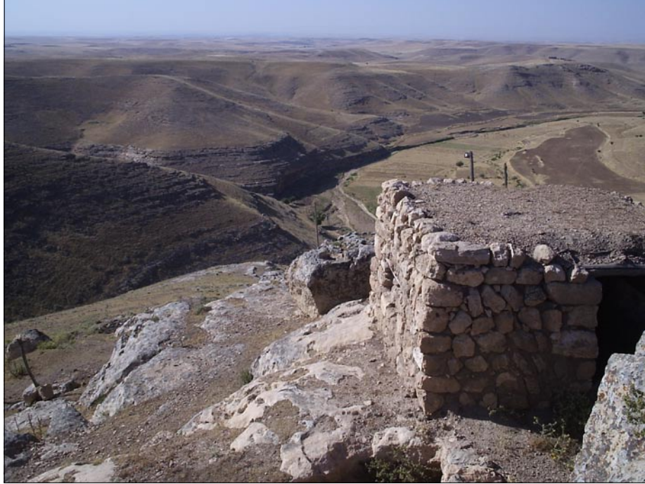
Kurdish village in the region of Tur Abdin, Turkey.

In short, Turkey is trying to play a more active role in the Middle East, a role made possible by the invasion of Iraq by the US. As the BBC stated: