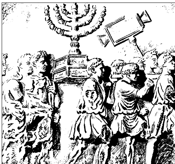
Relief from the Arch of Titus built to commemorate his victory over Jerusalem.

The way the symbols of the vision are structured leads us to the conclusion that it is the Roman power which is responsible for removing the daily sacrifice and treading the sanctuary and host underfoot. Without going into a lot of detail, it would seem reasonable to conclude that the