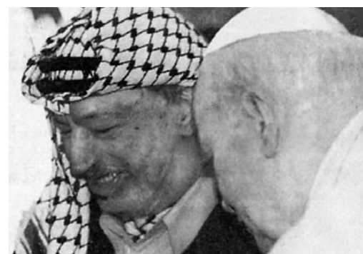
Pope John Paul II and Yasser Arafat get together in one of their meetings.

One objection to this interpretation might be, How could the death of an individual be so important? However, as we showed in Part 1 in