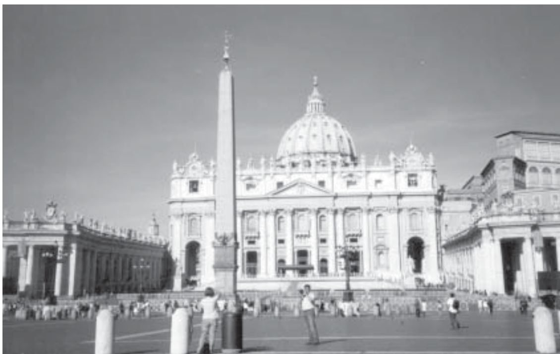
St Peter's Basilica in Rome, the "temple of God" (2 Thess. 2:4).

tion" (2:3). Some in Thessalonica were saying that Christ was about to return, but Paul shows that this "man of sin" had to be "revealed" before Christ returned. The man of sin would be a consequence of a "falling away", that is, a falling away from the true gospel. This shows that the origins of the man of sin would be traced back to Christianity and not to some other religion.