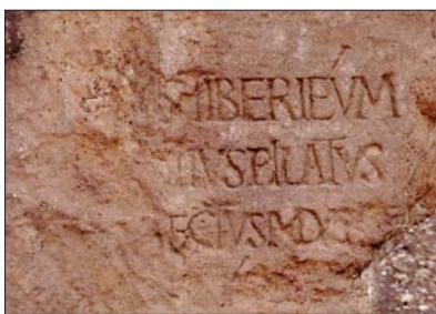
Inscription referring to Pontius Pilate found at Caesarea, the seat of the Roman governors of Judea

Erastus, one of Paul's co-workers (19:22; Rom. 16:23; 2 Tim. 4:20), is named as city treasurer (AV