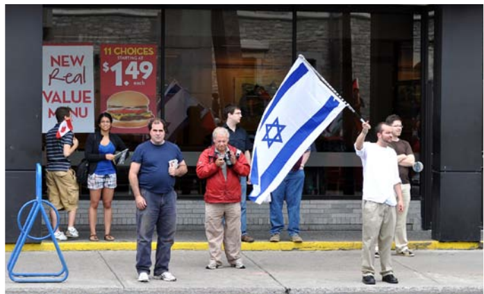
Supporters of Israel in June last year at a pro-Palestinian rally in Ottawa protesting Canada's support of Israel.

I N contrast, we have a small number of nations such as Canada speaking out in support of Israel. In a recent speech to the Canadian parliament the Canadian prime minister delivered a strongly worded warning about the resurgence of anti-Semitism in Canada and throughout the world. He said that the persecution of Jews is becoming a “global phenomenon in which anti-Semitic ideologies target the Jewish people in their homeland of Israel and use the cloak of human rights to do so . . . . When Israel, the only country in the world whose very existence is under attack, is consistently singled out for condemnation, I believe we are morally obligated to take a stand.” In addition, a gloom descended over the Palestinian leadership on news that President Obama no longer supported a Palestinian state