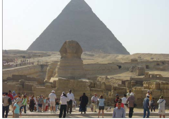
The Sphinx and Khafra's pyramid at Giza in Egypt.