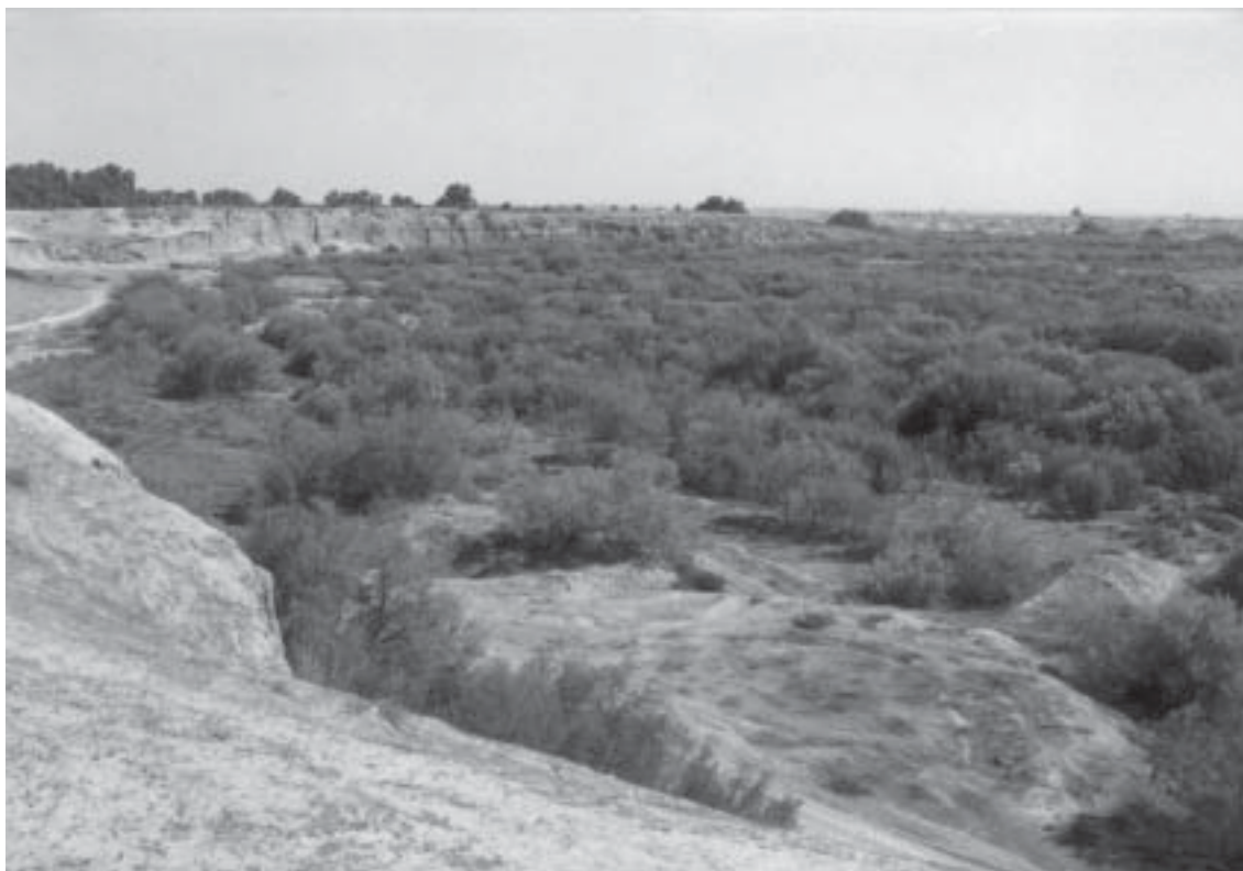
Nahal Besor, the brook Besor of 1 Samuel 30:9, and probably the valley of 1 Samuel 15:5.

admission reveals a very striking detail. The man spoke of his being a 'servant' and the Amalekite a 'master', as though this was the order of the day. By what other means than the Hyksos/Amalek identity could an Egyptian, the son of a proud and ruling nation, be the servant of an Amalekite, a poor nomad? This unfortunate man and his heartless master were already the last in their respective roles. The Amalekites were in retreat and decline, and only 400 men escaped David's subsequent retaliation.