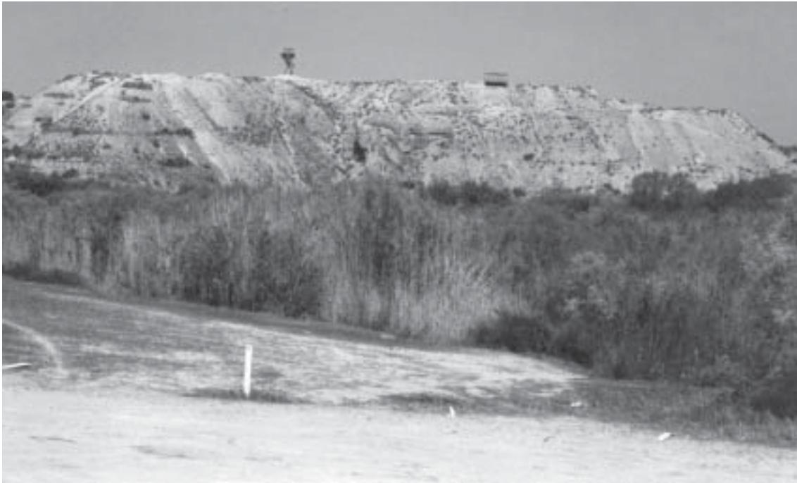
Tel Sharuhen, situated on the southern bank of Nahal Besor, and the most likely site of the Amalekite city taken by Saul.

consisted in flocks and herds, and it appears that they took their households along with them, even on their military expeditions (Judg. 6:5).